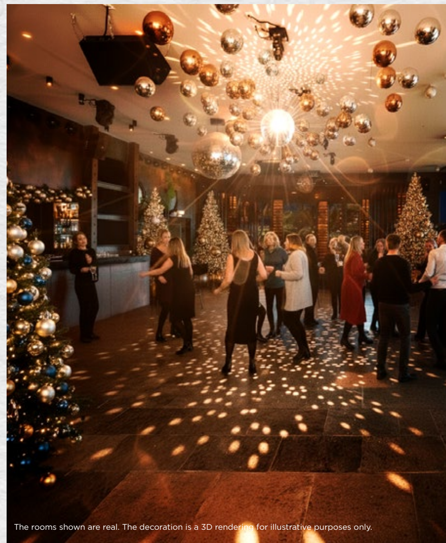
The rooms shown are real. The decoration is a 3D rendering for illustrative purposes only.

Mineral waters, juices, soft drinks and beer Sparkling wine sangria Selection of wines from Le Club Algarve Coffee and tea