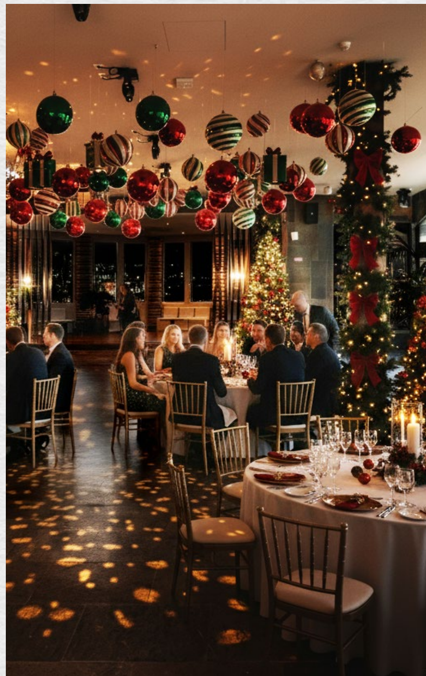
The rooms shown are real. The decoration is a 3D rendering for illustrative purposes only.

Hazelnut sablé, white chocolate crunch, lime cream, and vanilla ice cream Green apple namelaka, sour apple chutney, and white chocolate glaze Green tea Joconde cake, mango and passion fruit compote, yuzu mousse, and pistachio ice cream & Petit Fours