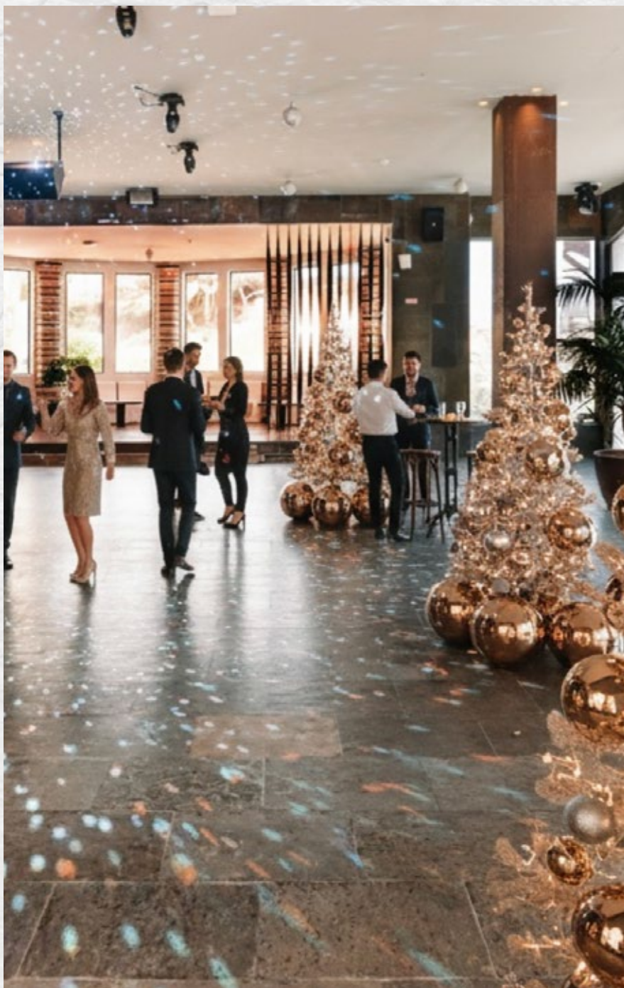
The rooms shown are real. The decoration is a 3D rendering for illustrative purposes only.