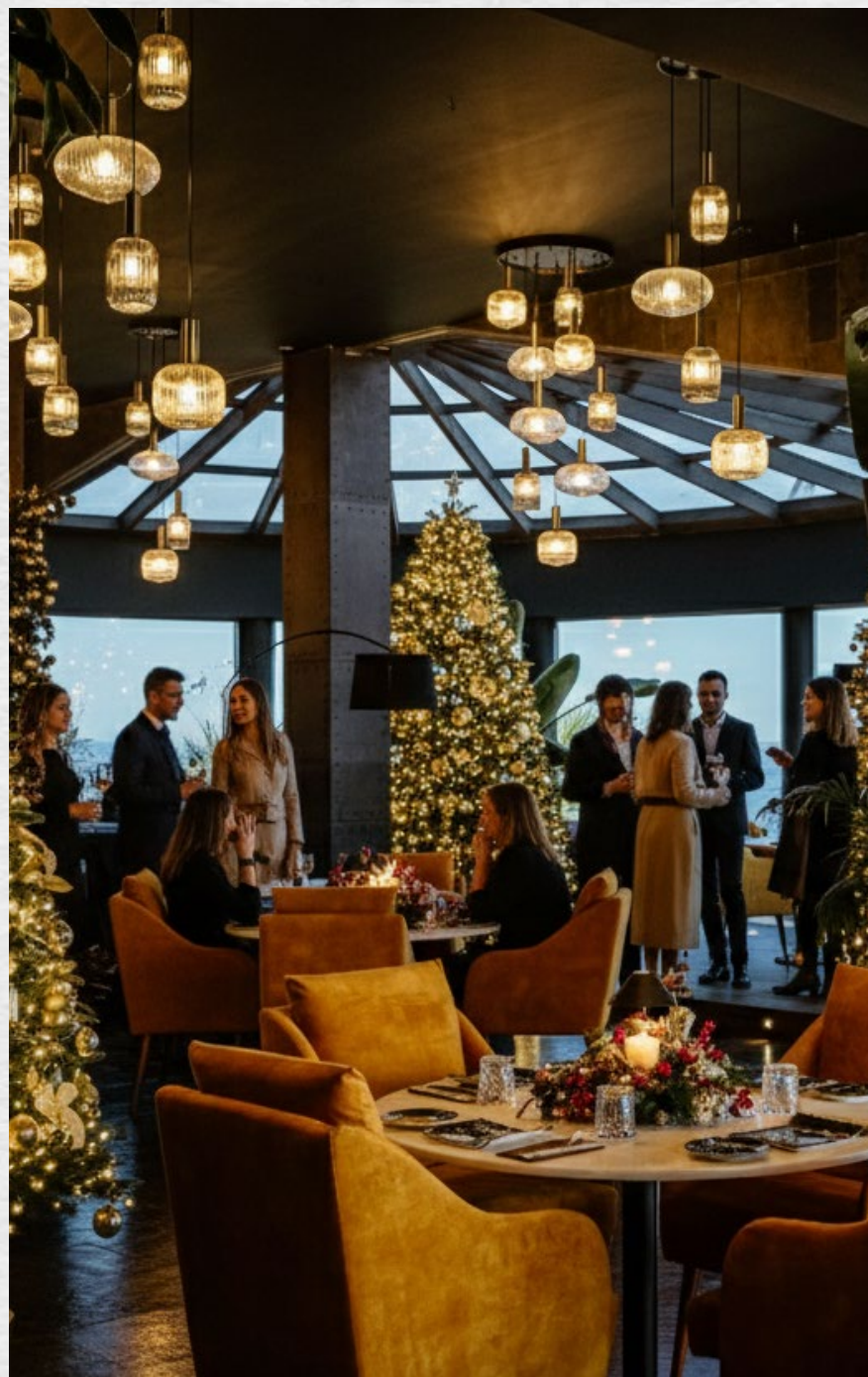
The rooms shown are real. The decoration is a 3D rendering for illustrative purposes only.

Here, your company party becomes a unique moment, with every detail designed to surprise and celebrate.