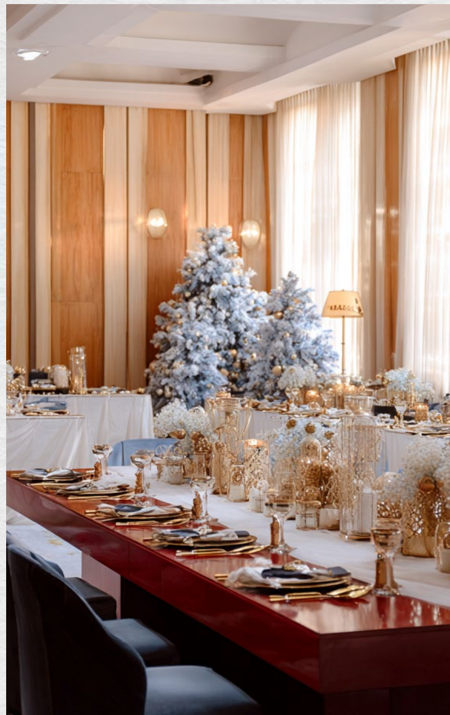
The rooms shown are real. The decoration is a 3D rendering for illustrative purposes only.