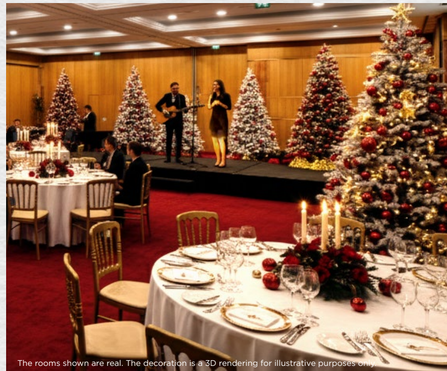
The rooms shown are real. The decoration is a 3D rendering for illustrative purposes only.

Roasted potatoes with garlic olive oil Almond and chive rice Sautéed vegetables with lemon and thyme