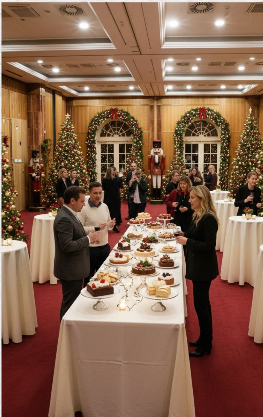
The rooms shown are real. The decoration is a 3D rendering for illustrative purposes only.